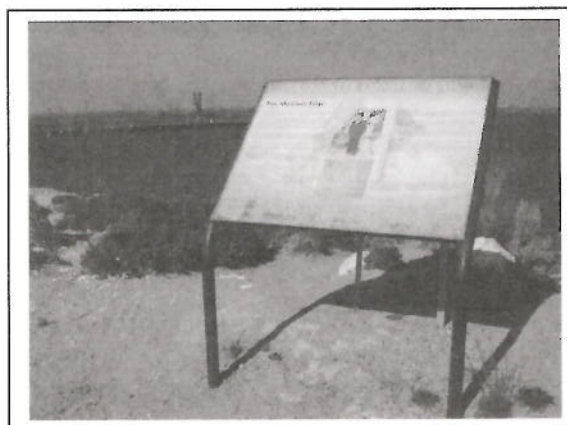
Figure 1. Encounter Coastal Trail sign at Pinky Point Lookout.

people, named as Wirangu. One of the interesting things about this sign is that the word 'Wirangu' has been erased. According to one story, this was done hurriedly at the opening ceremony, with a group of local Indigenous people forming a screen for the vandal as a government minister and other VIPs approached along the trail.